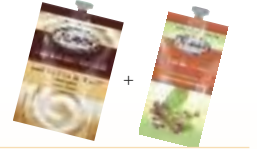
cappuccino/latte swirl + exotic chai

Choose the Indulgence button. Select Chai Latte. Follow the instructions on the LCD display. Add sweetener to taste.