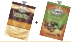
Milky Way® swirl + any coffee

Choose the Indulgence button. Select Milky Way® latte. Follow the instructions on the LCD display.