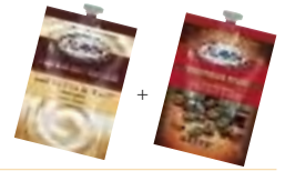
cappuccino/latte swirl + any coffee

Choose the Coffee button. Select Cappuccino. Follow the instructions on the LCD display.