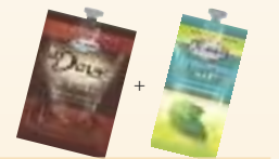
DOVE® hot chocolate + peppermint cool™

Choose the Chocolates button. Select Mochaccino. Follow the instructions on the LCD display.