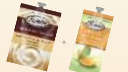
cappuccino/latte swirl + white tea with orange

Choose the Indulgence button. Select Chai Latte. Follow the instructions on the LCD display. Add sweetener to taste.