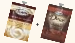
cappuccino/latte swirl + DOVE® hot chocolate

Choose the Chocolates button. Select Chococcino. Follow the instructions on the LCD display.